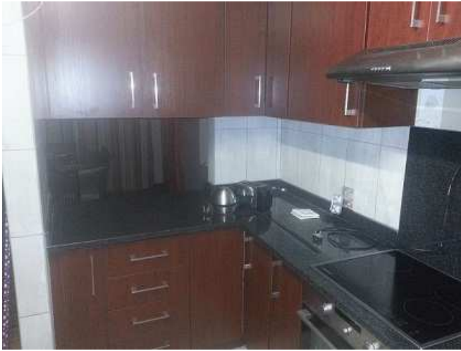
Granite Tops and Kitchen Cupboards