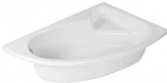
Corner Bath Main En-suite