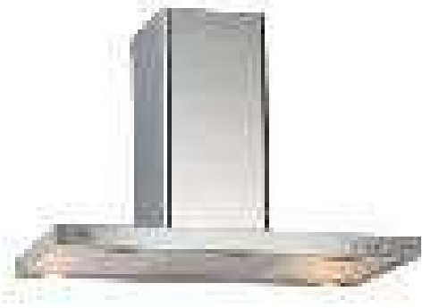
900mm Defy Chimney Extractor