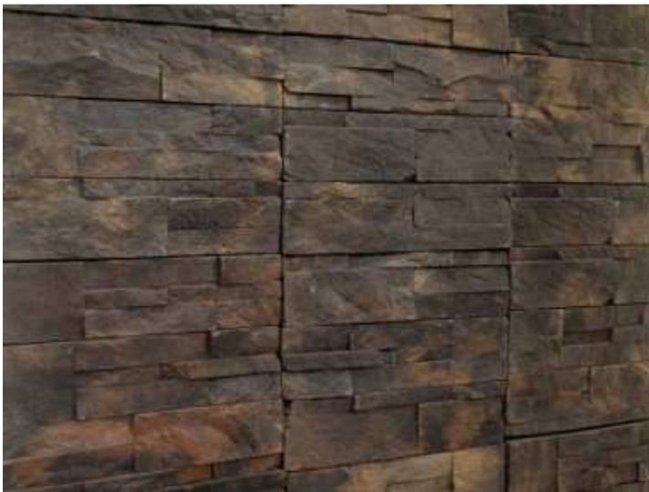
Feature Wall Cladding