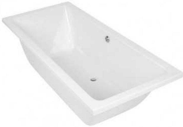
1700 Standard Bath