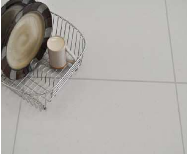
Glazed Porcelain 600 x 600 Tiles