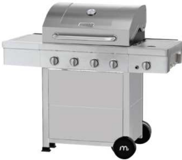
4 Burner Gas Braai