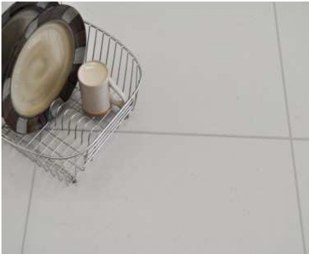
Glazed Porcelian 600 x 600 Tiles