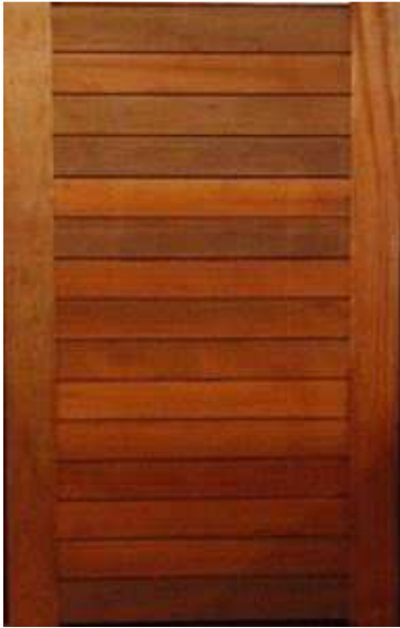
Horizontal Meranti Slatted Door 813x2032