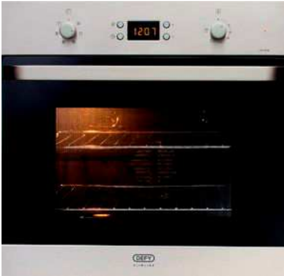
900mm Defy Oven and Hob Combo