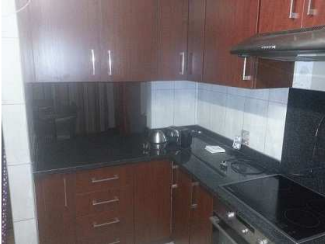
Granite Tops and Kitchen Cupboards