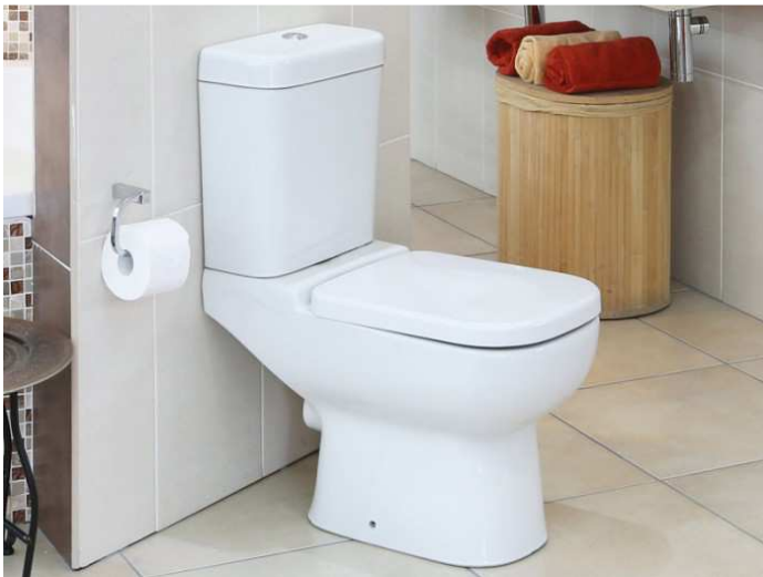
Close Couple Toilet Top Flush Soft Close Lid