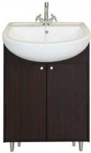
Vanity and Basin Combo