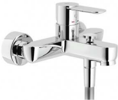
Tap Range as per specification