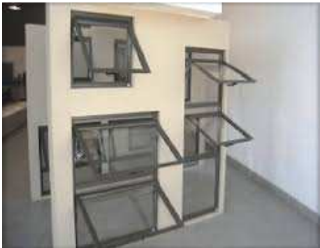
Bronze Aluminium Windows