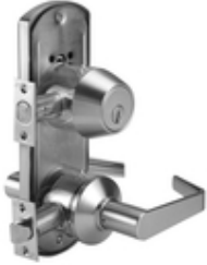
Front Door Lockset