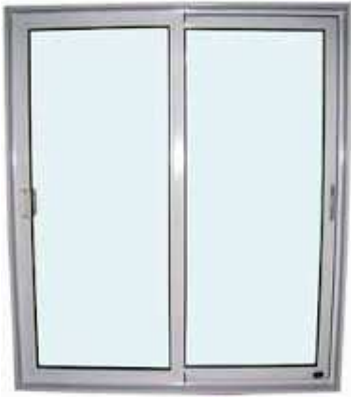
1800 Sliding Door Aluminium